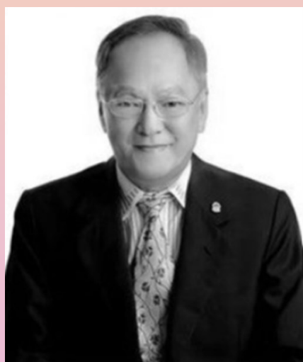
LION KER @ TAN TIONG HIN TING