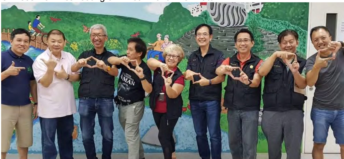
Photography Interest Group Workshop 2019