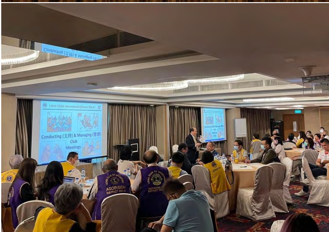
Participants paying close attention at the School.