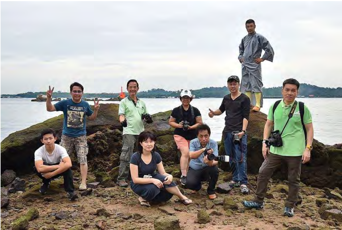
Outing on 8 Sep 2016 at Changi Point Boardwalk.