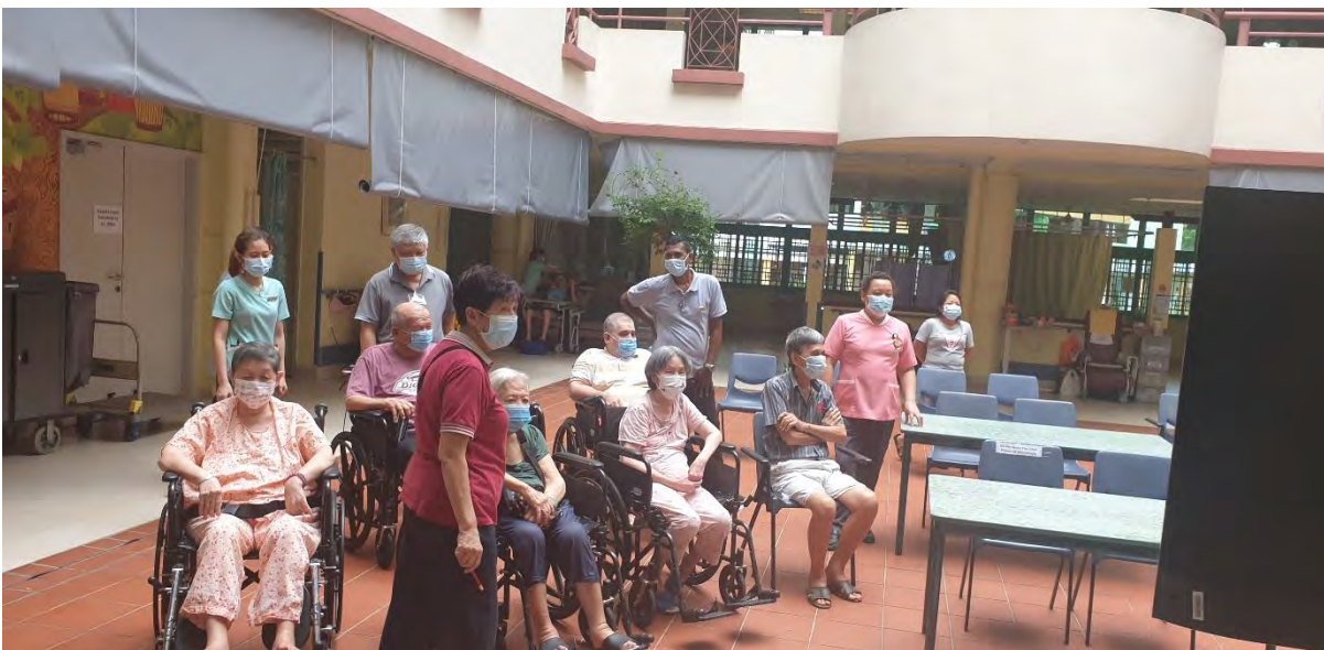
LHE residents in attendance of the workshop held on 14 th June 2022.