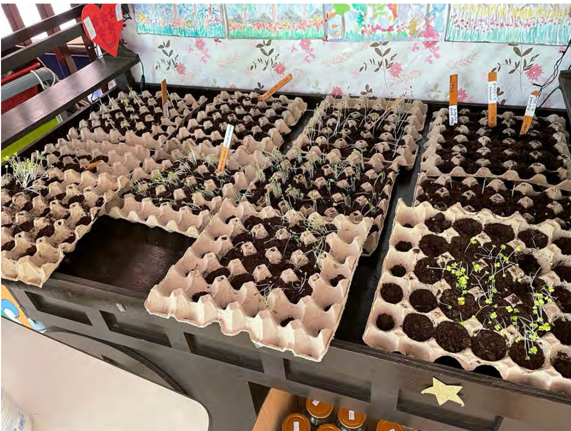
Seeding of donated edible plants. E.g., Eggplant, Corn, Kailan, Bai Chai.