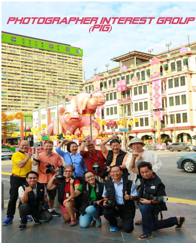
Chinese New Year outing on 27 Jan 2019 in Chinatown.